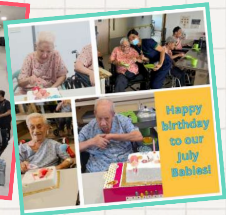
Heartfelt thanks to Hope Worldwide for sponsoring monthly birthday cakes!