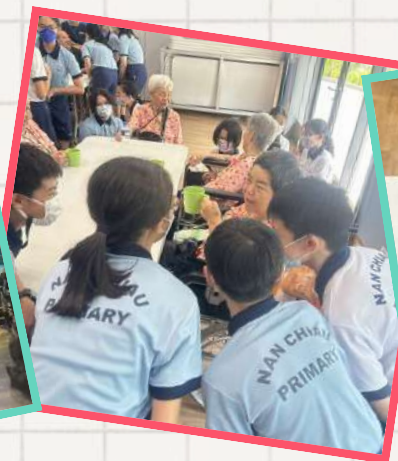
与南侨高中学生的互动!