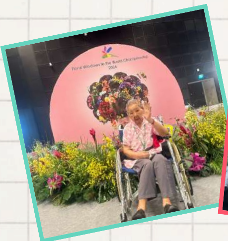
Trip to Singapore Garden Festival with manpower support from Catherine group.