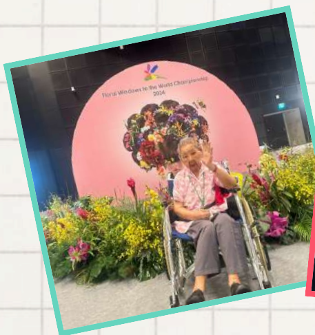
在Catherine group 志愿者的 协助下, 老年住户参观了 新加坡园艺节。