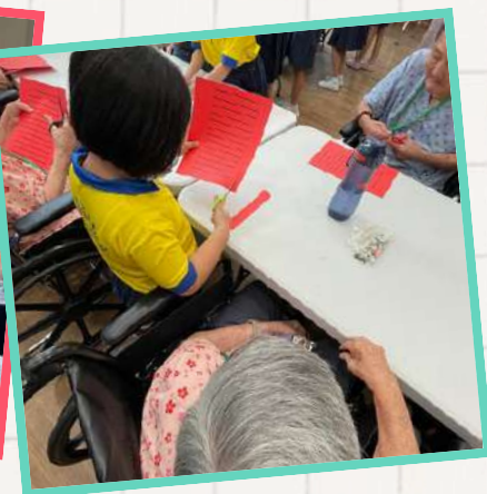
与爱同小学的学生 一起庆祝中秋节! 有朗诵, 灯笼制作等等!