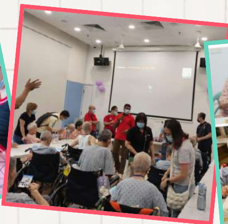
新加坡科技工程有限公司 来了! 志愿者们分成小组进 行各种活动。