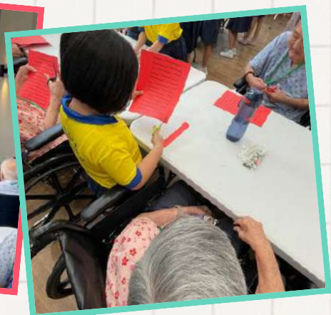
Mid-Autumn Celebration with students from Ai Tong primary school.