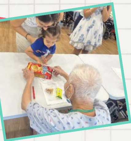
Bridge Builder 赞助了茶点, 并和我们的住户一起玩游戏。