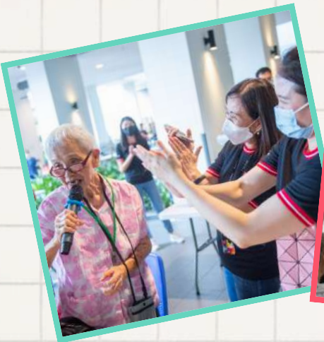
Grateful to DBS for arranging exciting activities for our lovely residents!