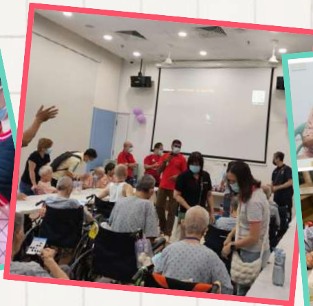
ST Engineering in the house! Volunteers were split to conduct various activities.