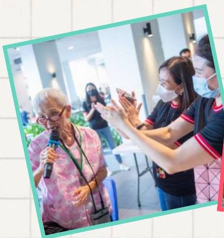
感谢星展银行为我们的可爱住户 安排精彩的活动!