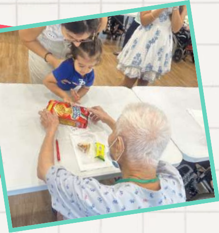
Bridge Builder sponsored tea break and played games with our residents.