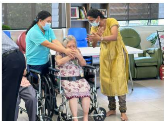
Performance by Meiling Group.