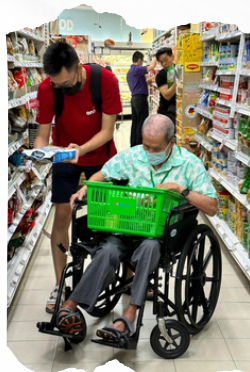
Fun outing at Punggol Plaza! 在榜鹅广场的外出活动!