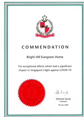
首席执行官鍾女士代表光明山修身院领取了 "总统表彰证书" 奖。以表彰认可我们在新加坡抗击 COVID-19 的斗争做出的卓越贡献。