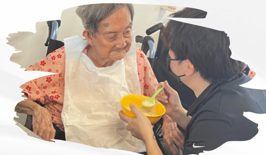
Feeding befrienders from Alight Solutions. 来自Alight Solutions的用餐伙伴。