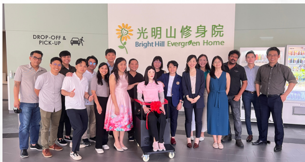
Dexie, a humanoid robot that can sing, communicate, engage in exercise and play bingo with residents, made its debut here! 人形机器人, Dexie 在光明山修身院首次亮相! 她可以唱歌、交流、做运动并与住户一起玩游戏。