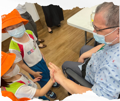
The presence of pre-schoolers bring immense joy and laughter to our residents! 幼儿园儿童的到来,带给住户无穷的欢乐和笑声!