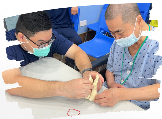
What did they make from the towel folding? 他们用毛巾折叠了什么?