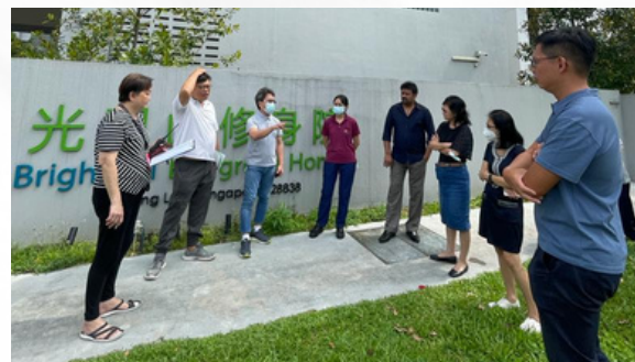
Fire Drill and demonstration exercises to prepare us for emergency situations. 员工参与消防和示范演习, 好让我们能为紧急火灾情况做好准备。

This quarterly publication is produced by Bright Hill Evergreen Home's Communications team. We welcome any contributions or feedback at community@bheh.org . 此季刊由光明山修身院企业通讯部编辑。我们欢迎您的反馈和宝贵意见。