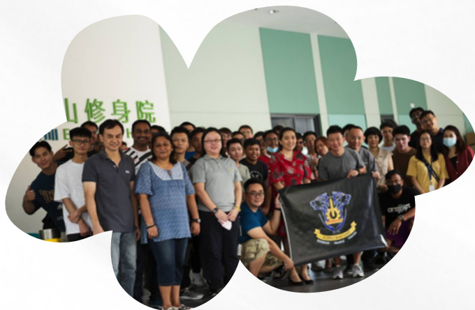
The SAF team generously assisted us by cleaning wheelchairs, serving lunch, and feeding our residents! 新加坡武装部队慷慨地为我们清洁轮椅、提供午餐和当住户的用餐伙伴!